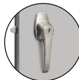
6" steel handle (includes two (2) keys)