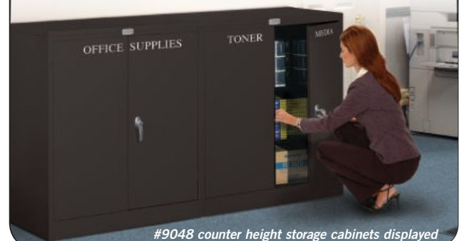
#9048 counter height storage cabinets displayed

Constructed of 20 gauge steel, Salsbury counter height storage cabinets (#9048) offer versatile applications and are ideal for offices, garages, institutions and schools. Measuring 36" wide, 42" high and 18" deep, the two (2) door storage cabinets are available in a gray, tan or black powder coated finish. Counter height storage cabinets are 18" deep and include two (2) adjustable shelves that can accommodate contents up to 180 pounds per shelf evenly distributed. Counter height storage cabinets feature two (2) 17" wide doors and a 6" steel handle with a built-in three (3) point locking mechanism with two (2) keys.